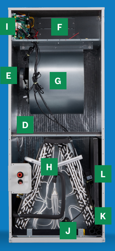
Bosch BOVA Ultra Series High-Efficiency Outdoor Inverter Condenser